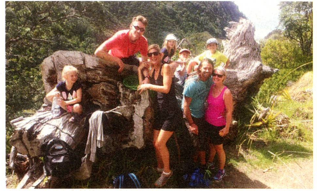
lunch break at the coromandel walkway

dition against the Auckland Club. The shooting had already been won by Auckland and it looked as if the bowling was all in their favours, but the last couple of Hamilton bowlers made all the difference. It all came down to the card playing where Hamilton managed to win, so now the Hamilton Club will make their way to Wellington on Queen's Birthday weekend for the final against the Taranaki Club.