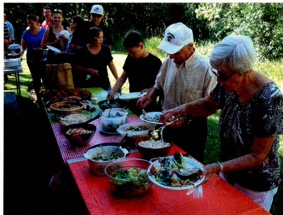
Prince George and area Swiss celebrating Swiss National Day 2015