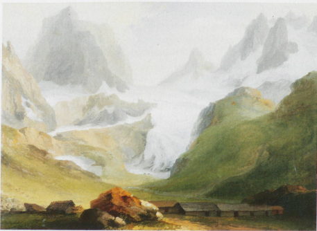
Gadmen Valley with Tittlis, Wenden Glacier, Grassen and the Fünffingerstock