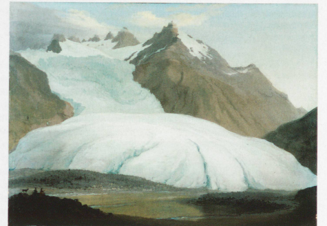
Rhône Glacier from the valley near Gletsch