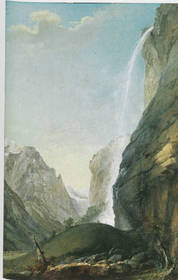
The Staubbachfall in summer