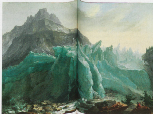
Lower Grindelwald Glacier, with the Lüttschne River and Mettenberg