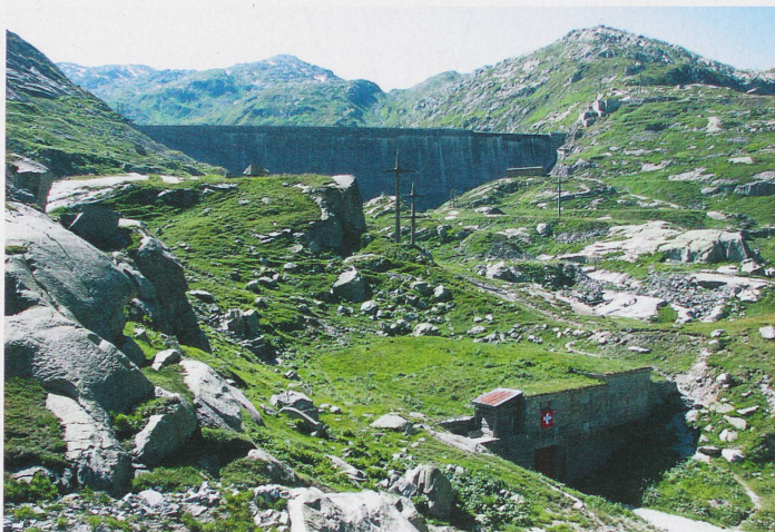
The entrance to the artillery bunker beneath the Gotthard, which is today the La Claustra seminar and themed hotel