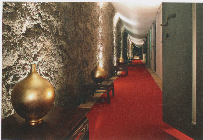
The entrance to the La Claustra seminar hotel