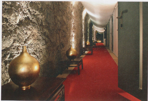
The entrance to the La Claustra seminar hotel