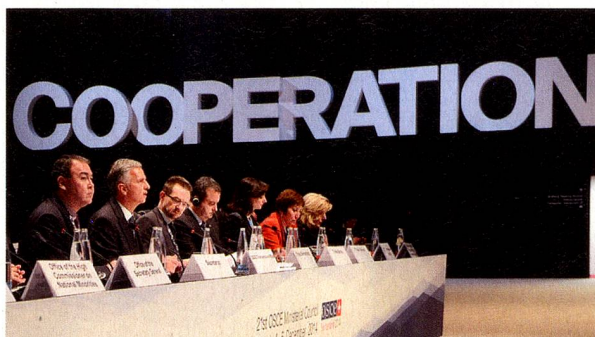
Table of the Chairmanship in the Ministerial Council

Visit the 2014 Swiss Chairmanship web dossier for more information: https://www.eda.admin.ch/eda/en/home/aktuell/dossiers/osze-vorsitz-2014.html