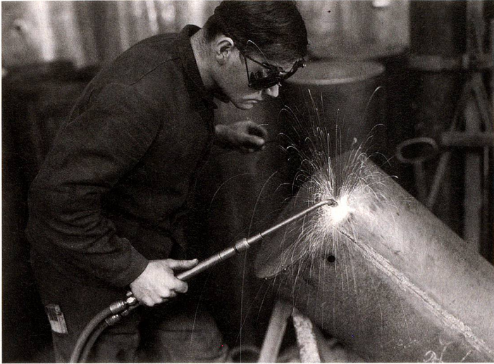
Welders, taken around 1940 in Frauenfeld

The exhibition at the Swiss National Museum in Zurich runs until 31 January 2016. Limmat-Verlag has published a book on the exhibition entitled "Arbeit – le travail"; 224 pages containing various articles and 218 photographs; CHF 48, Euro 52. www.limmatverlag.ch , www.nationalmuseum.ch