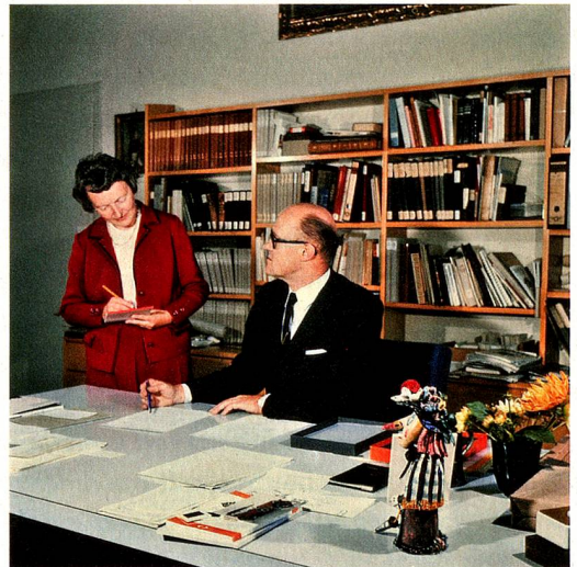
Director of the Swiss National Museum in Zurich with his secretary, taken around 1975