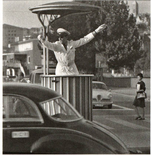
Traffic policeman in Zurich, taken around 1960