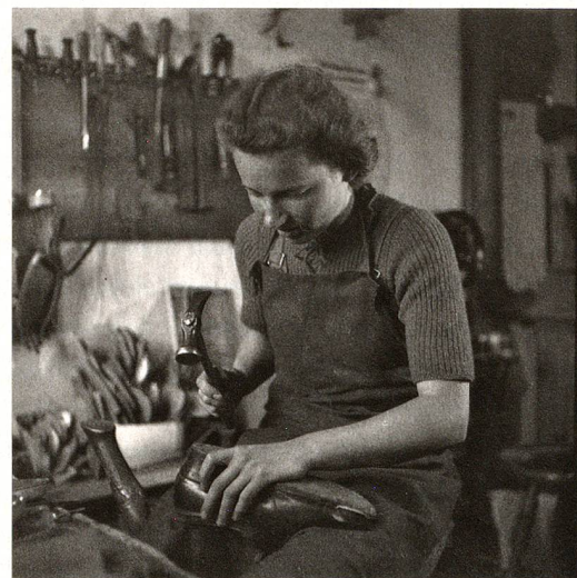
Switzerland's first female shoemaker, taken in 1944 in Lachen