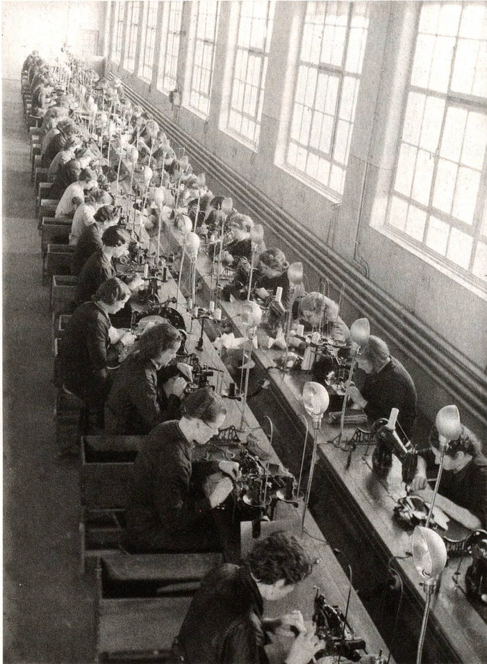
Seamstresses, taken around 1940