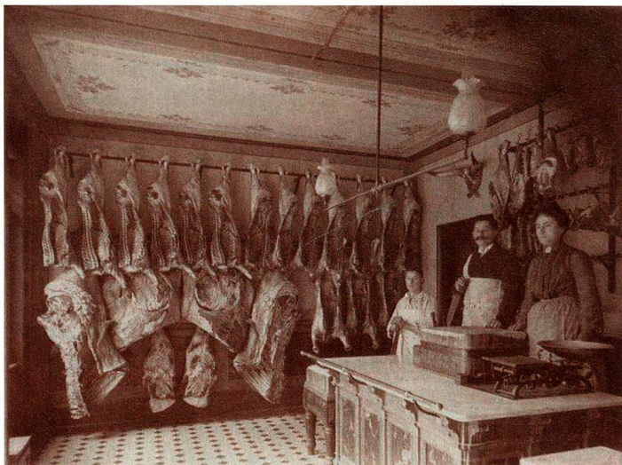
The workers at the Levy butcher's shop in Basel, taken between 1890 and 1910

ees has also altered. Photographs of people at work taken between 1860 and 2015 are currently on show at the Swiss National Museum in Zurich. They impressively document the changes in the world of work and people's relationship with their jobs.