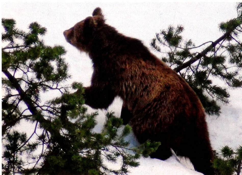
The M13 bear, photographed in Engadine in April 2012, migrated from Italy and was shot in February 2013

The otter has come home, proving how much the condition of the waters has improved. Wolves are back, un-