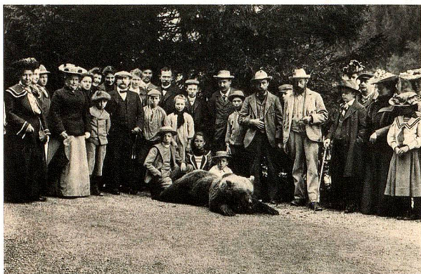
The last bear killed is proudly presented in 1904

Switzerland is becoming wilder – indigenous but eradicated predatory animals are returning. City dwellers far removed from nature are thrilled at the prospect but sheep and mountain farmers are outraged. Especially as far as wolves are concerned, society fluctuates between glorification and primordial fear.