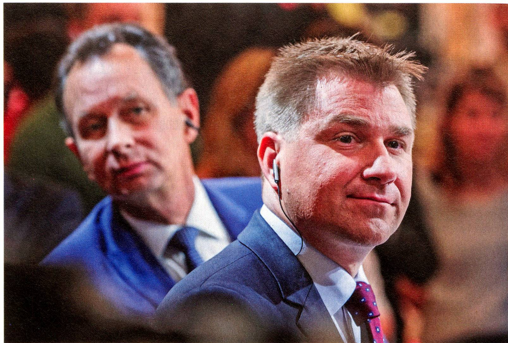
Presidents of the conservative parties await the election results: Toni Brunner (SVP), in front, and behind him Philipp Müller of the FDP

■ The Swiss Green Liberal Party (GLP) had a major setback, especially in light of its spectacular gains in 2011 when it increased its number of seats from 3 to 12 after securing 5.4 % of the vote. It has now slipped back to 4.6 % and has seen its number of seats, now standing at 7, almost halved.