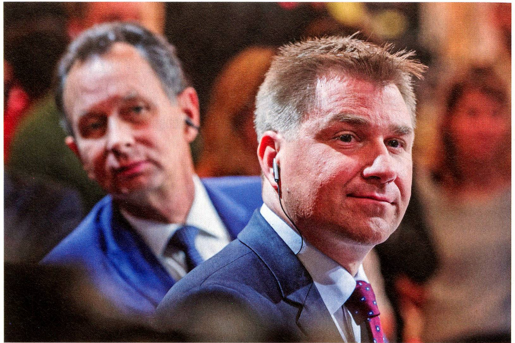
Presidents of the conservative parties await the election results: Toni Brunner (SVP), in front, and behind him Philipp Müller of the FDP

■ The Swiss Green Liberal Party (GLP) had a major setback, especially in light of its spectacular gains in 2011 when it increased its number of seats from 3 to 12 after securing 5.4% of the vote. It has now slipped back to 4.6% and has seen its number of seats, now standing at 7, almost halved.