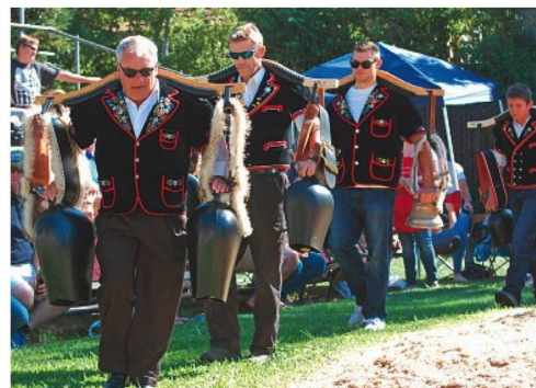
Two views of the colorful Alpauzug with the dairy steer and the cowbell ringers