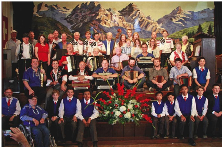
All the artists on stage for the 23rd Pacific Coast MusicFest