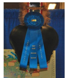
The William Tell display and the 1st place blue ribbon in the educational division which the Swiss booth received.