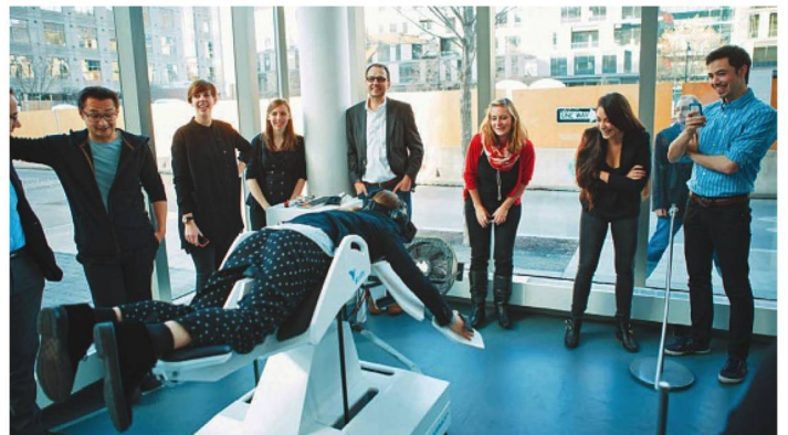
The swissnex Boston Team flying high with Birdly.