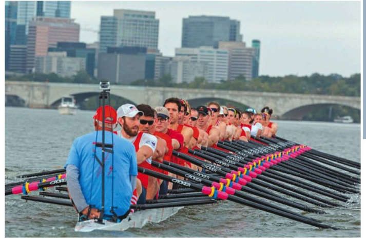
The Stämpfli Express is taken on a spin by 24 elite rowers. Swiss rowing legend Melch Bürgin is coxing

As a major effort in displaying Swiss Innovation and getting people talking about Switzerland in general, we - with support from Presence Switzerland, Basel-Stadt and Swiss International Air Lines - brought the Stämpfli Express to its first-ever tour outside of Europe. From Boston, MA to Chattanooga, TN it was displayed and rowed at