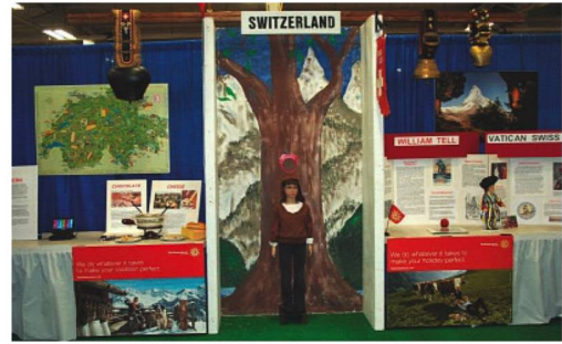
The greatest hit at the Swiss booth was the central display of a manikin representing Tell's son. It was a target for guests to try to shoot a marshmallow, with a marshmallow-firing crossbow into the apple.