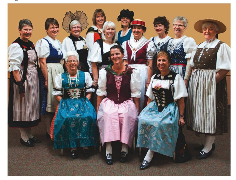
Back row: Murten/Fribourg, Appenzell Ausserrhoden, Bern, Oberengadin/Graubuenden, Waadtland, St. Gallen/Toggenburg, Basel. Middle row: Bern, Ober Wallis, Front row: Appenzell Innerrhoden, Glarus, Bern