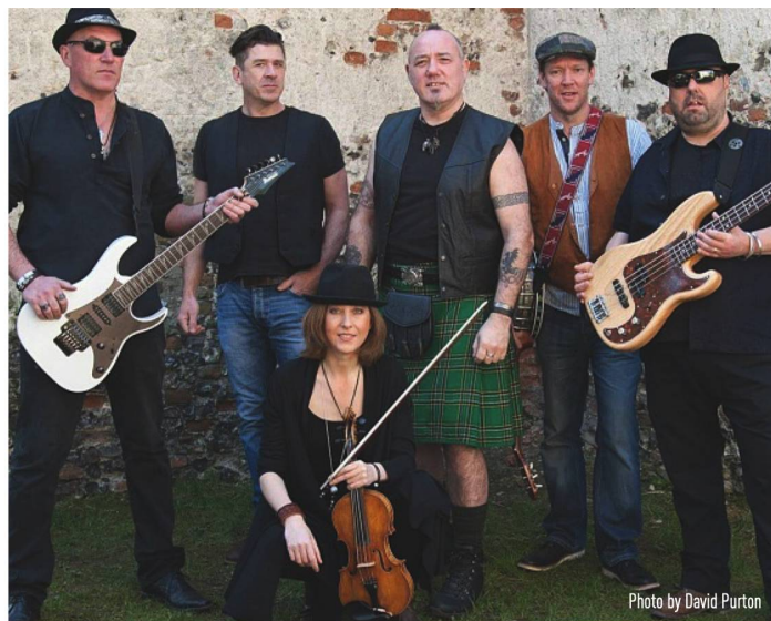
Clan of Celts