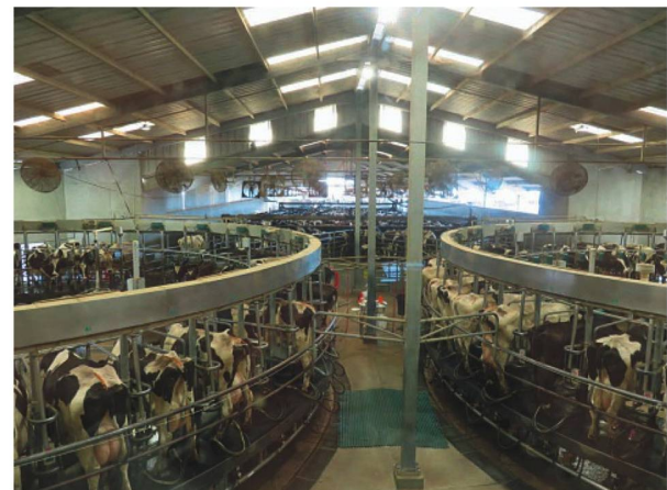
The milking parlor featuring two 48 stall rotary units, also roofed