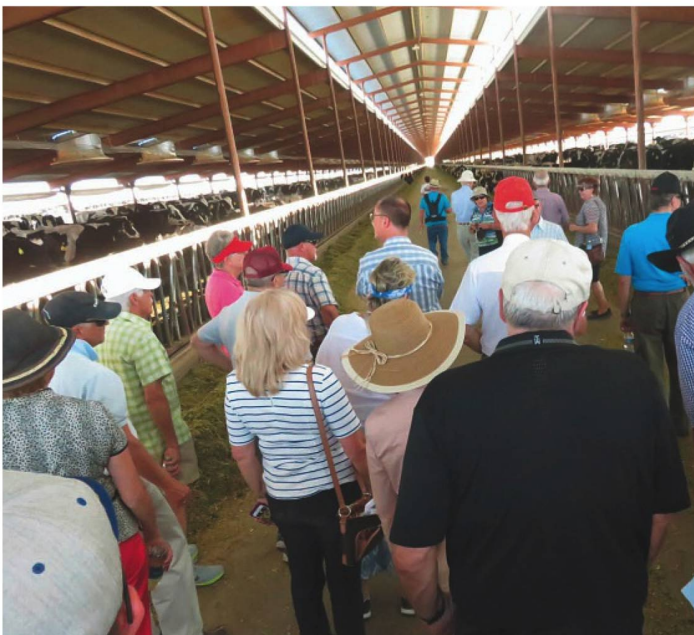
Entering one of the giant, roofed and climate controlled barns

TEXT AND PHOTOS BY ELLEN MUSKATEVC AND MAX HAECHLER SWISSCONSUL@ICLOUD.COM