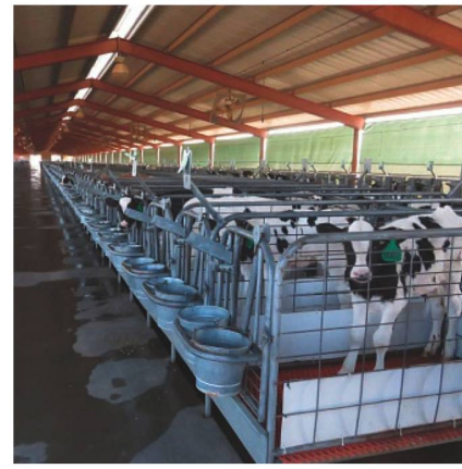
About 400 calves are raised in a separate calf barn..