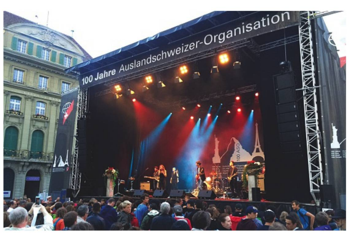
100 years ASO celebration with concerts and activities on the Bundesplatz in Bern

This year, the CSA meeting and OSA congress was particularly interesting. The OSA was celebrating its centenary with a remarkable program. There were concerts on Friday evening and the whole Bundesplatz was dressed in OSA colours. Many information stands and lots of happy people enjoyed what the expat community had on offer. Different groups were presenting themselves and sharing their experience and knowledge. The speech of Bundesrat Didier Burkhalter was also very inspiring.