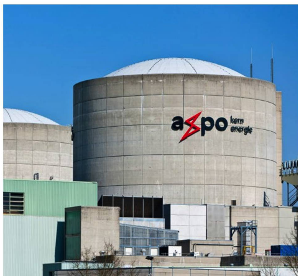
Beznau I is the oldest nuclear power station in the world having been in service for 47 years.