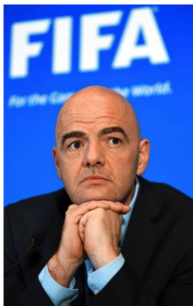
Gianni Infantino still has to prove how serious he is about reforming FIFA.

Gianni Infantino, the new FIFA President from Valais, is already coming under pressure. What can we expect from him?