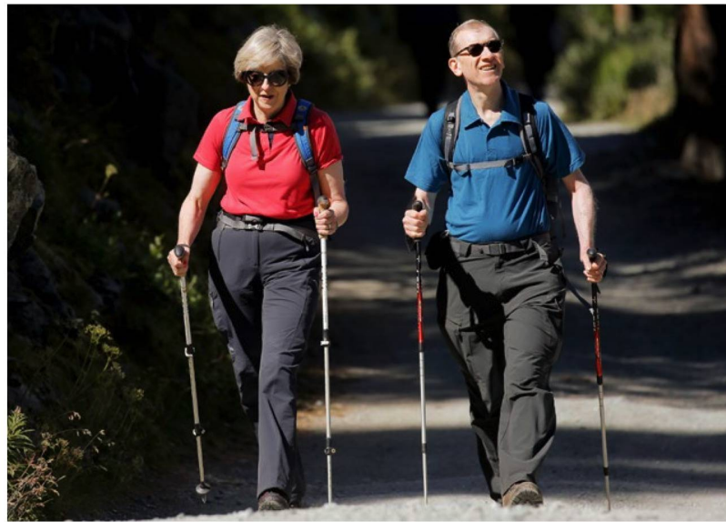
A good omen? British Prime Minister Theresa May and her husband Philip spent their summer holidays in Zermatt.

centres in Switzerland before recruiting applicants from abroad. On the other hand, a regional and sector-specific protection clause suggested by the CVP would also apply. Experts are not ruling out the possibility that such a package, which would require neither ceilings nor quotas and would therefore be compatible with EU principles, could be approved by 7 February 2017.