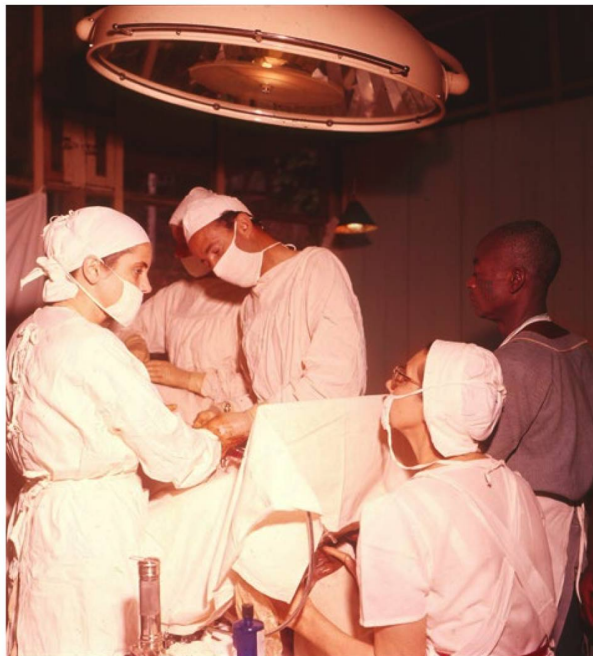
This reportage photo shows medical missionary Albert Schweitzer in a hospital in Lambaréné in the 1930s.