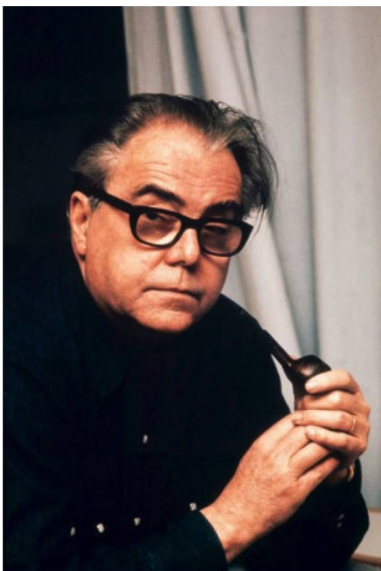
The archive also includes famous figures such as Max Frisch, pictured here in 1974.