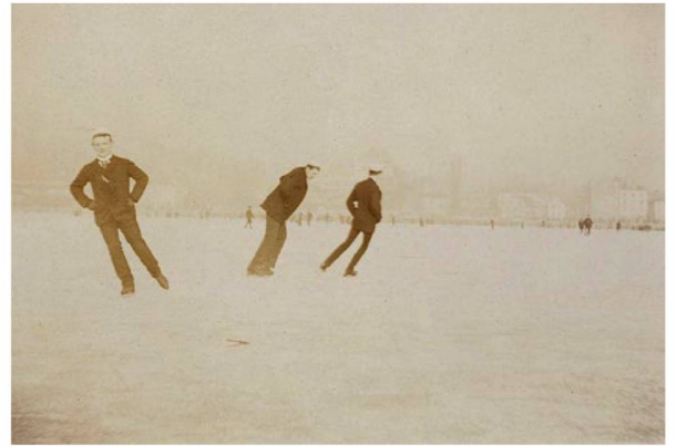
The Federal Institute of Technology archive contains thousands of scenes from everyday life, such as these ice skaters on a frozen Lake Zurich in 1891.