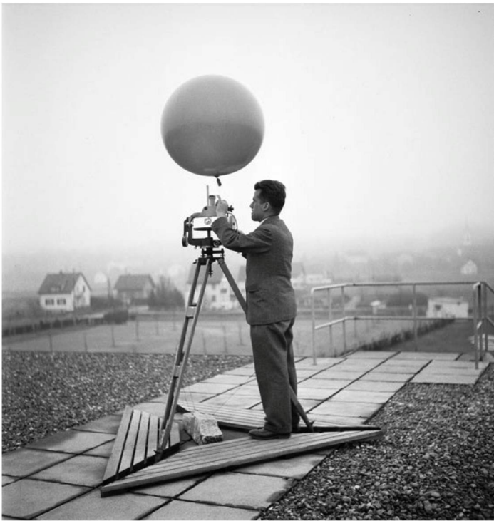
The Swissair archive is part of the Federal Institute of Technology library. This historical photo shows a meteorologist with a weather balloon in Dübendorf.