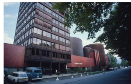
Swiss construction projects in the archive: a photo of the Swiss Museum of Transport in Lucerne from the 1970s.