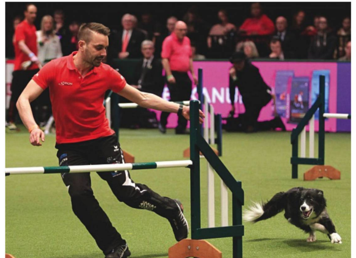
Cute on her way to victory