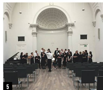
3. A beautiful and elegant wedding venue