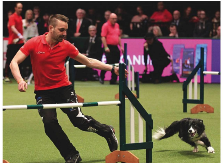
Cute on her way to victory