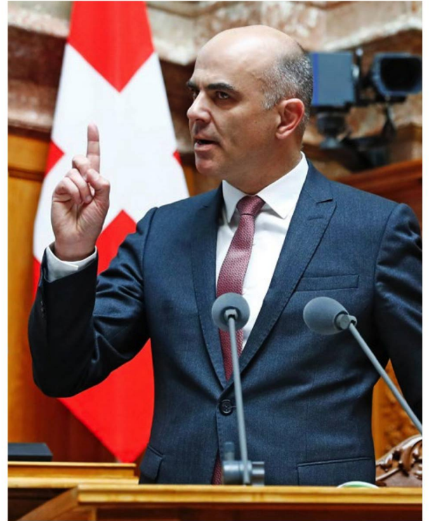
Federal Councillor Alain Berset could soon clinch "his" pension reform.

Social Affairs Minister Alain Berset (SP) now has the opportunity to go down in history as the Federal Councillor to bring about the first AHV reform since the 1990s while at the same time putting the second pillar on a more solid footing by lowering the conversion rate which determines the level of pension. In 2010, 72 % of the electorate rejected