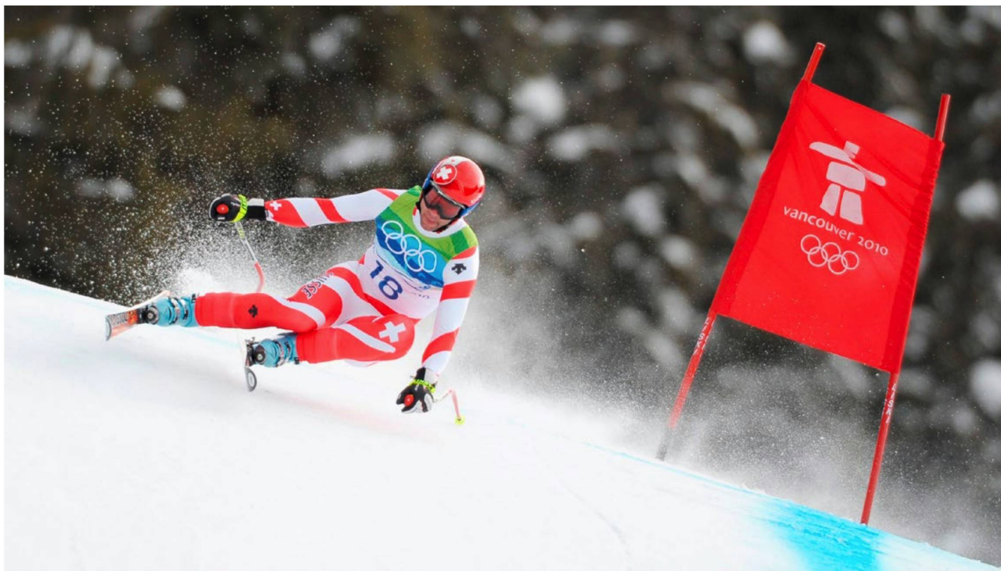
Sion 2026 will create spectacular images broadcast throughout the world, but will also stimulate the debate as to how tourism and everyday life in the Alpine region can develop sustainably. In the photo: Didier Defago at the Olympic downhill in Vancouver 2010