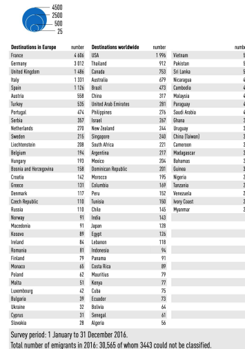
Survey period: 1 January to 31 December 2016. Total number of emigrants in 2016: 30,565 of whom 3443 could not be classified. Please note: The depiction of borders and the use of names and titles on this map does not mean that Switzerland officially endorses or recognises them.

Number of Swiss emigrants per destination