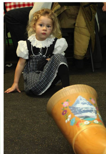
Edmonton Swiss Society family events of 2017