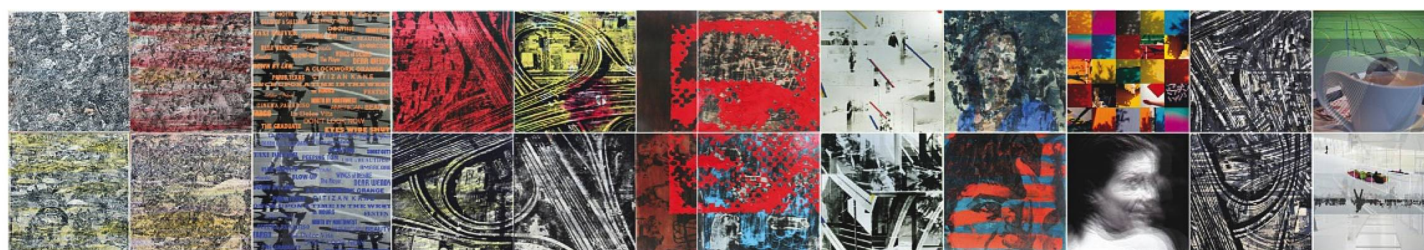
Reflexorama fries. Variety of media, 122 x 720cm