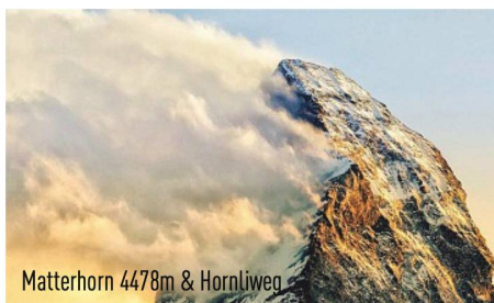
Matterhorn 4478m & Hornliweg