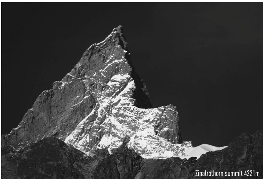
Zinalrothorn summit 4221m