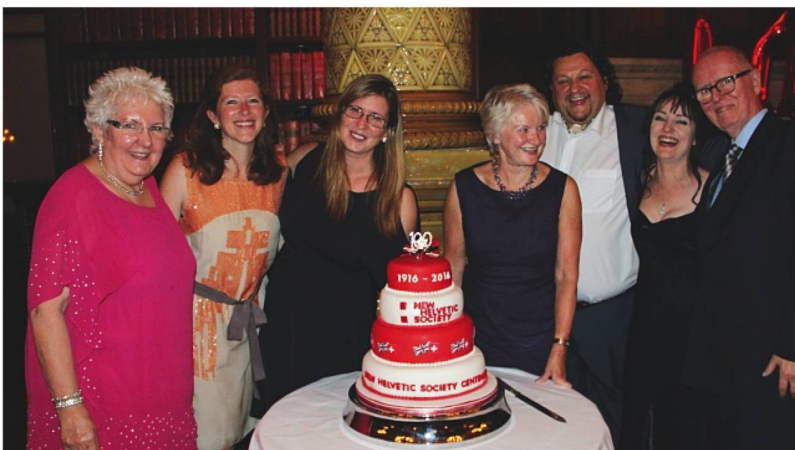
NHS committee celebrating the Centenary of the club in London.

MEMBER OF THE COMMITTEE AND TREASURER OF NHS