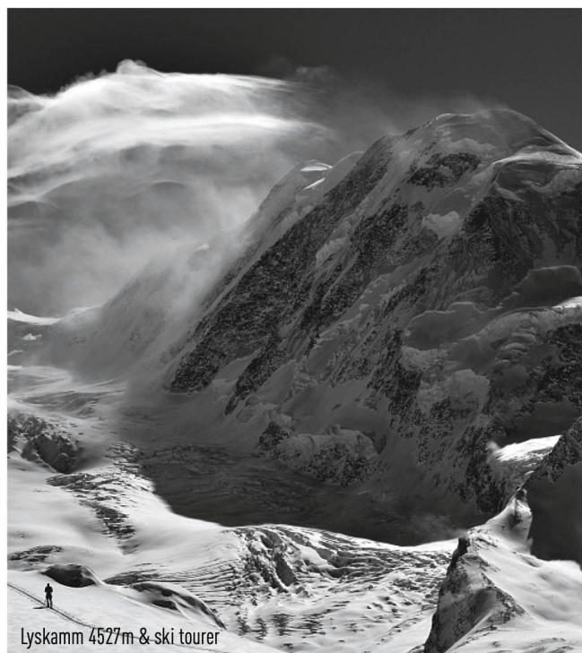
Lyskamm 4527m & ski tourer