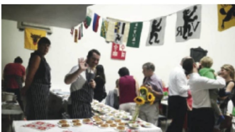
Traditional raclette and excellent Swiss beer.

In the autumn we will be organising more community events. Full details will be available shortly on our website, Facebook and Eventbrite. A date for your diaries is Saturday 9 December when we will be holding a Family Events Day with Samichlaus. Sign up to our monthly email newsletter to be kept informed of everything happening at the Swiss Church.