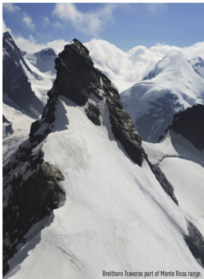
Breithorn Traverse part of Monte Rosa range.