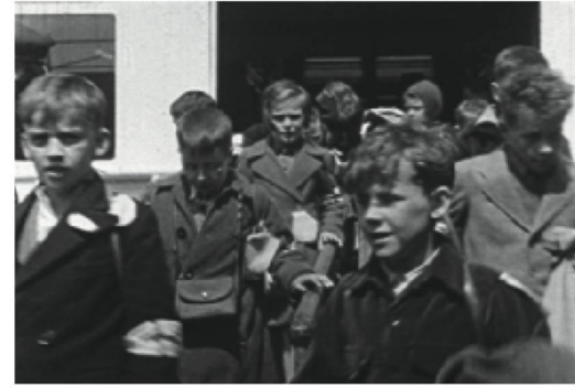
Children from Manchester and Salford returning from trip to Switzerland