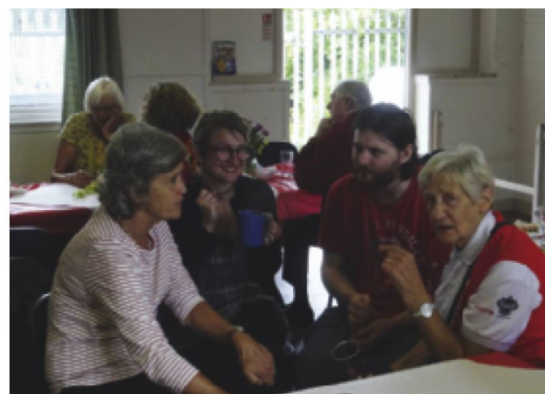
Swiss-Scottish members enjoying our National Day in Edinburgh.

More information about club's event: swissclubedinburgh.co.uk FB: @swissclubedinburgh