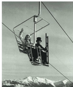
These two "harbingers of good fortune" opened the world's first detachable chairlift on 16 December 1945 in Films.