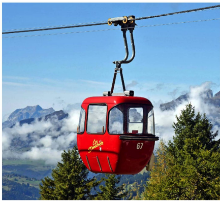
The bright red Giovanola gondolas from the 1970s were in operation until April 2017. The Federal Office of Transport did not renew the licence, but there are plans for a replacement system.