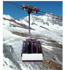
This system represents a remarkable piece of innovation. The world's first aerial cable car on three cables has been travelling up the mountain in Saas Fee since 1991.