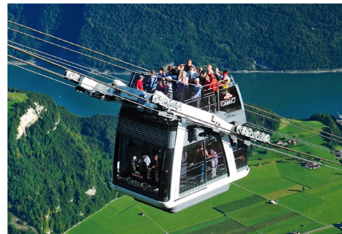
A world first built in 2012: a convertible-style cable car at Stanserhorn in Nidwalden.