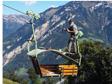
Small cable cars are a vital lifeline for many families and alpine farms in central Switzerland – one of these is the Bärchbahn near Isenthal which has been in operation since 1979.