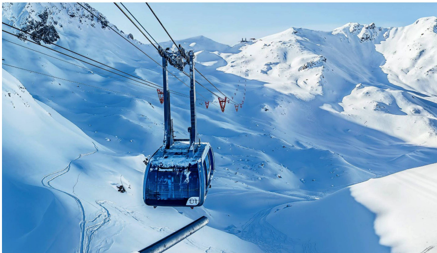
The "Urdenbahn" in Arosa and Lenzerheide is Switzerland's fastest cable car. The stanchion-free aerial tramway has connected two ski resorts since 2014 without having to open up new slopes.