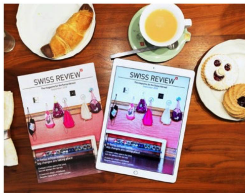
Whether on paper or on a screen the content of the “Swiss Review” is always identical, regardless of its form.