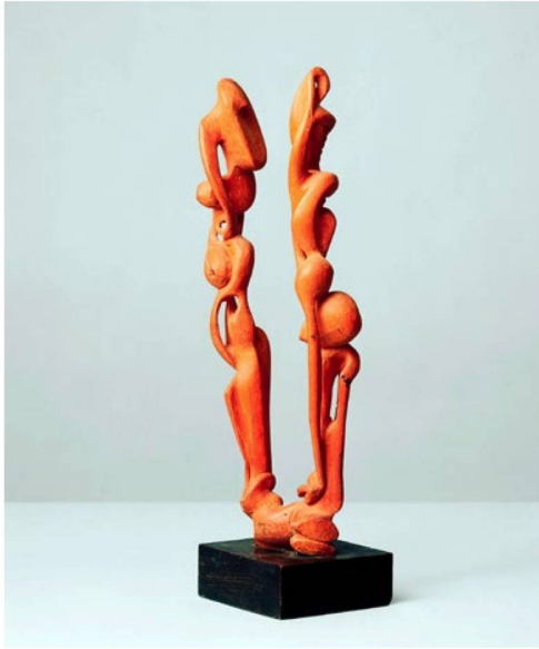
Serge Brignoni Érotique-végétal I, 1933 wood