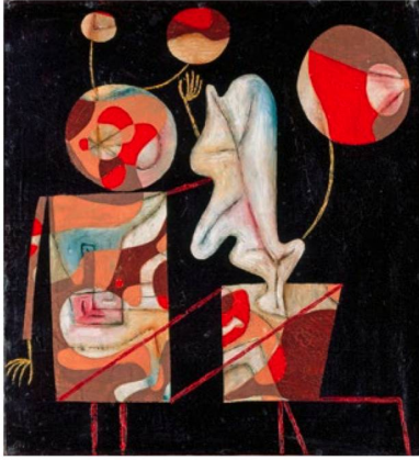
Paul Klee Marionettes, 1930 oil on cardboard