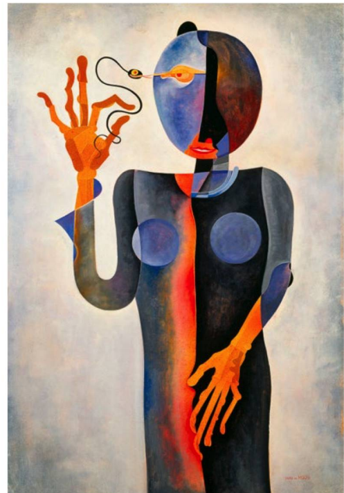
Max von Moos Schlangenzauber, 1930 tempera and oil on cardboard

"Surrealism Switzerland", Aargauer Kunsthaus, Aarau, until 2 January 2019 www.aargauerkunsthaus.ch ; The exhibition is accompanied by a richly illustrated publication with various texts and 61 artist portraits in German and Italian. 288 pages, 300 colour images, CH 59.-