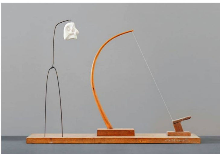
Alberto Giacometti Fleur en danger, 1932 wood, plaster, wire and string