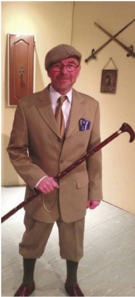
Above: Two scenes from "Miss Sophie's Erbe" (Miss Sophie's Inheritance)