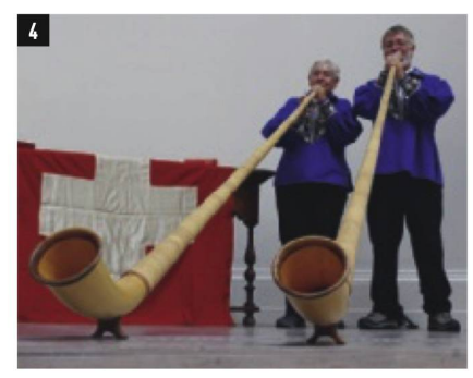
1: About 70 volunteers and over 200 people joining the National Day