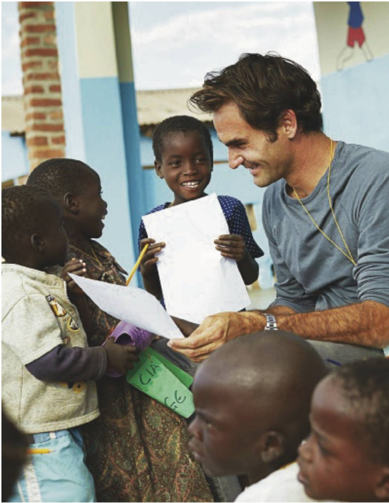
All the proceeds of the Match in Africa go to the Roger Federer Foundation.

proceeds of the Exhibition Night will go to the Roger Federer Foundation.