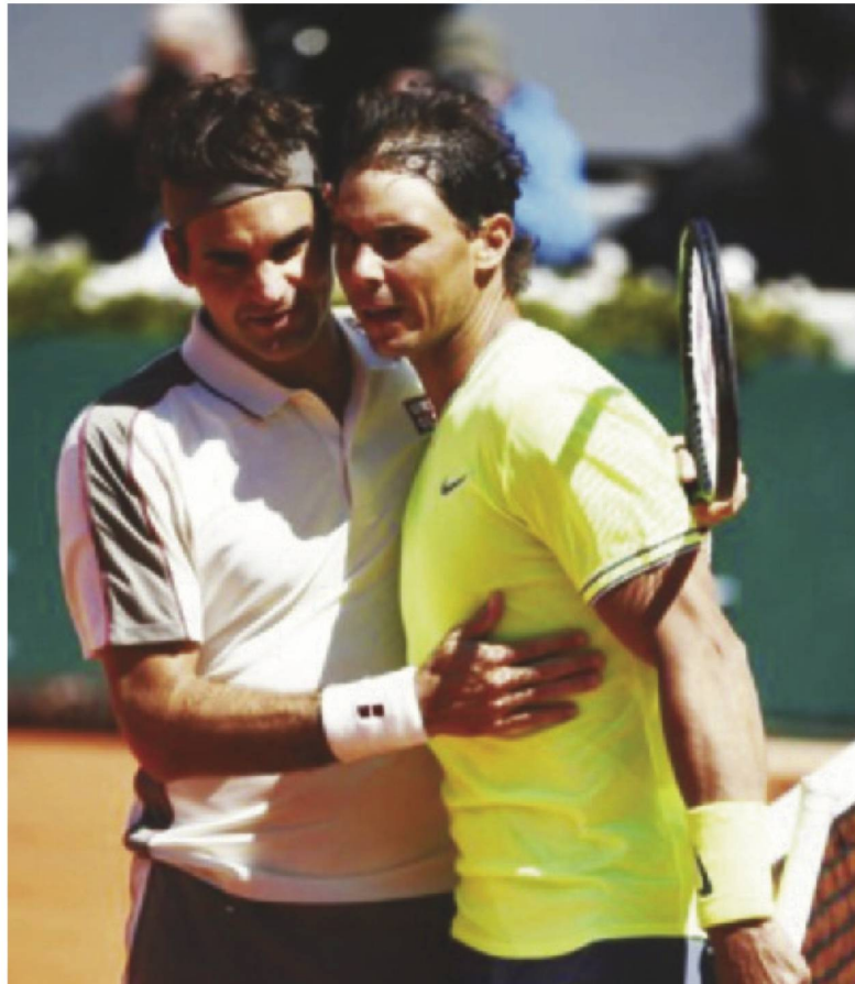
Federer and Nadal to attempt world attendance record in Cape Town.

The Match in Africa is presented by ROLEX, and Credit Suisse is one of the official sponsors. The net