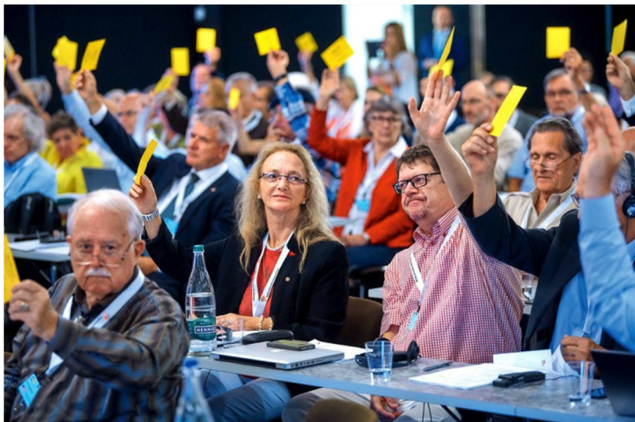
Political signals from Montreux: resolutions of the Council of the Swiss Abroad call on the Federal Council to act.

Finally, the election manifesto approved by the CSA contains further political demands. Besides the core demand to make it easier