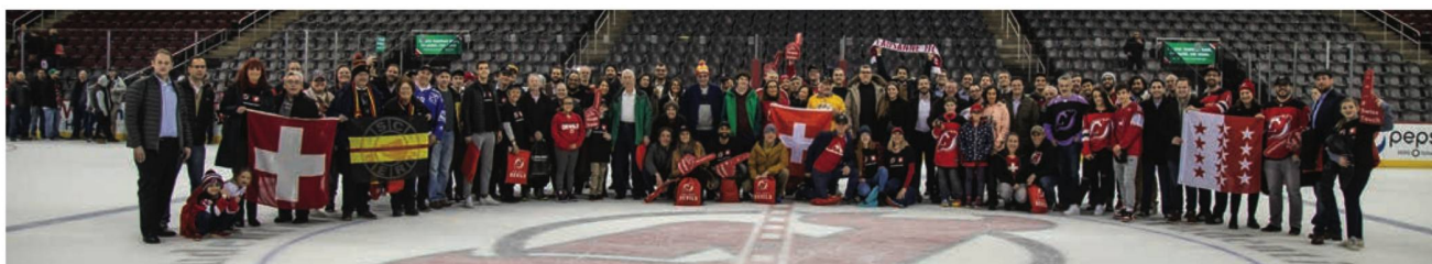
Group picture on the ice