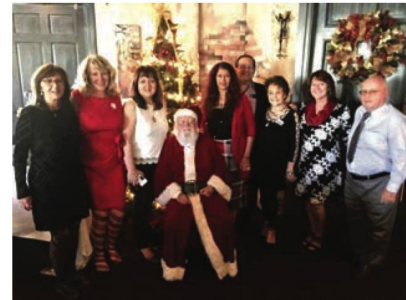
Board of Directors with Santa