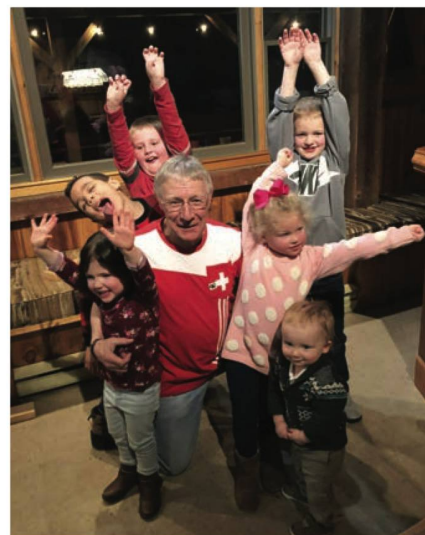
Our smallest snowboarder!