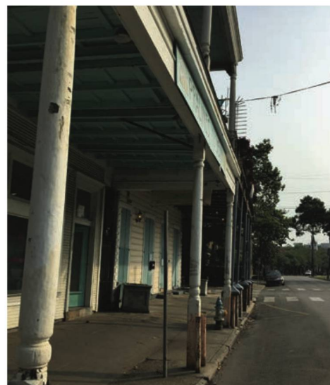
Empty street, St. Charles Avenue, Sunday, April 19, 2020

Stay well, be safe and hopefully things will be looking up by the time of our next submission.