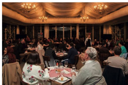
Pialligo Estate glass house

The event showcased a glimpse of what Switzerland and its unique natural landscapes have to offer. Who knows... once international travel restrictions will be lifted, the evening’s guests might have the opportunity to complete their Swiss experience with a nice holiday in the Alps!