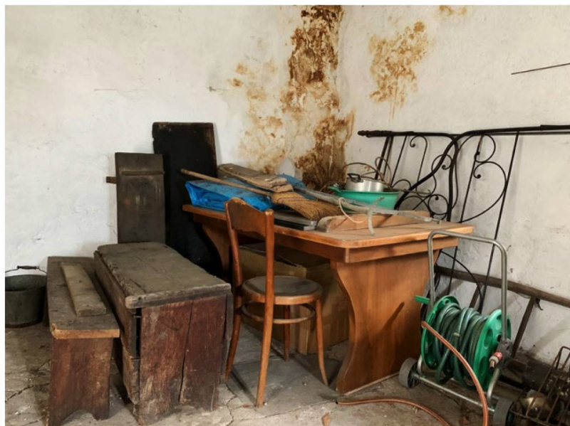
The migration has left its mark. Abandoned items everywhere are gathering dust.

Giacomazzi can understand their scepticism, but points out that the conversion work can only go ahead when all the money has been collected. The total budget is 3.6 million Swiss francs. “And at present, we still need just short of 600,000 Swiss francs,” says the architect. He seems con-