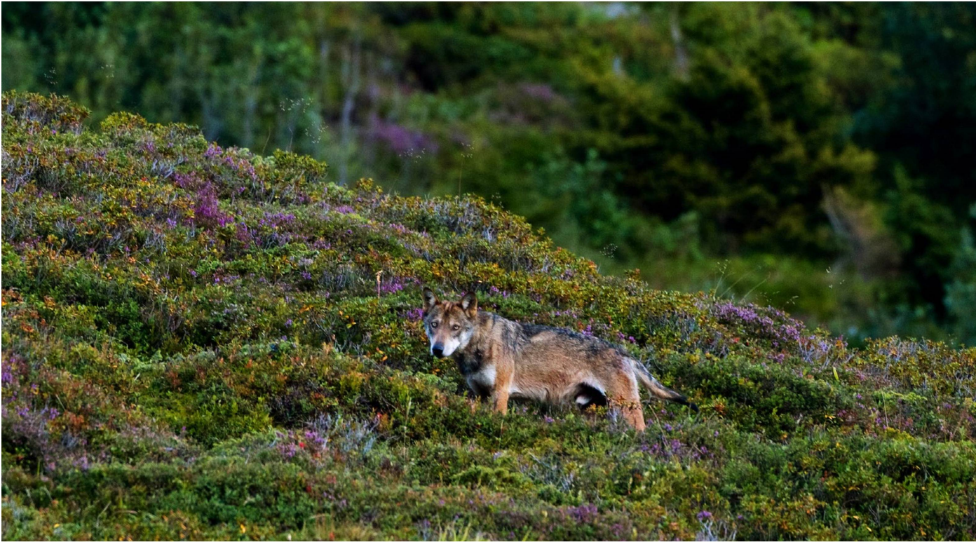
Nature photographer Peter A. Dettling took this photo of a feral wolf in Surselva in August 2006. It was one of the first such pictures taken without the help of a photo trap.