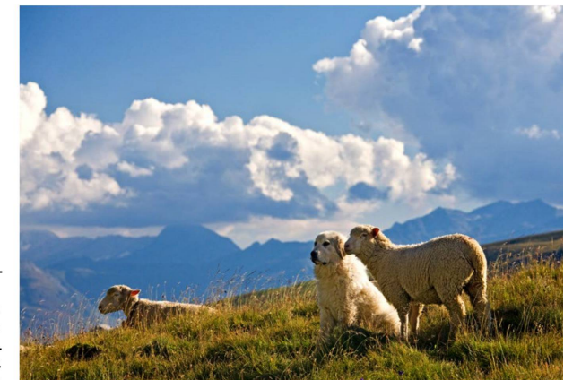
A Maremmano-Abruzzese sheepdog protecting its flock on the Grisons mountain pastures.

It is also permitted to kill wolves if the same wolf is shown to have been responsible for too many livestock losses; the red line is normally