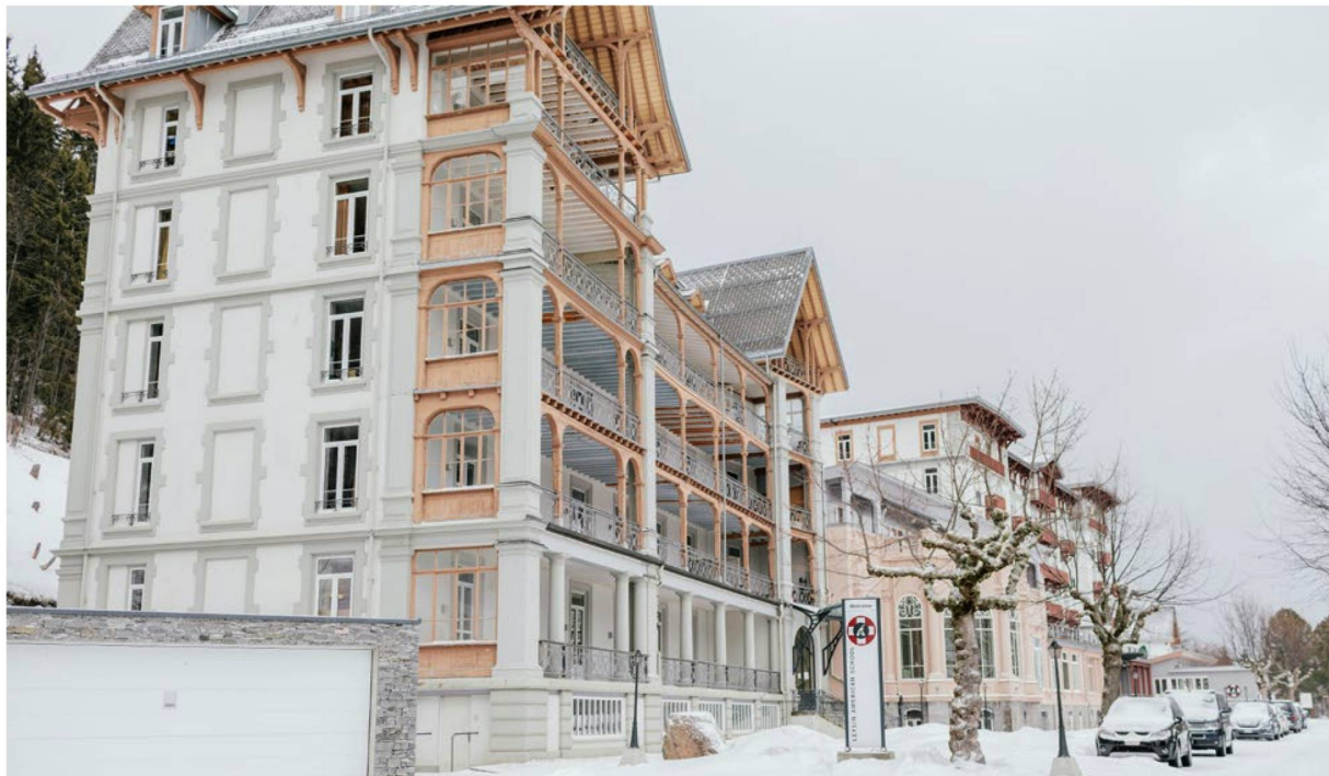
Leysin American School used to be a sanatorium for tuberculosis patients. It is now a place of learning for children of the wealthy.