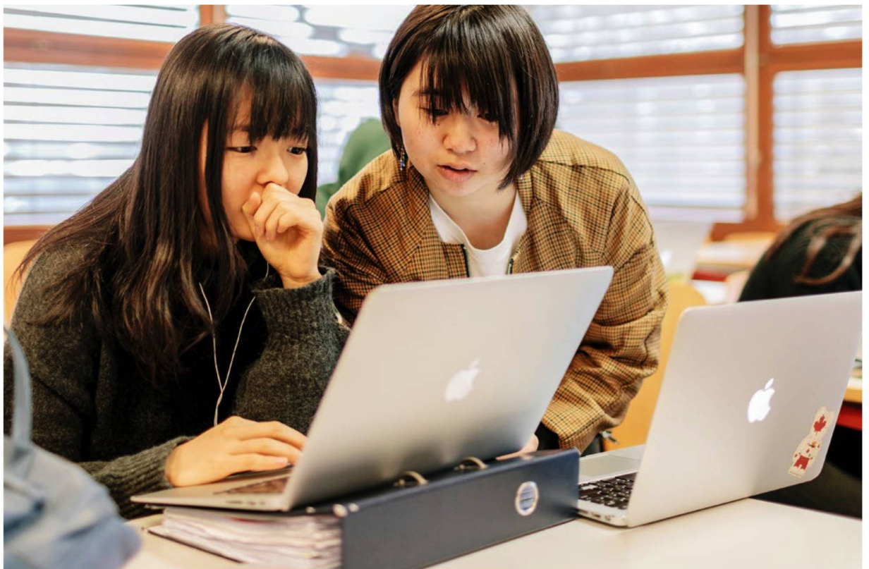
Typical Leysin – foreign students account for a quarter of the population.

Higher, further, faster, more beautiful? In search of the somewhat different Swiss records. Today: The Swiss municipality with the highest proportion of foreign nationals.