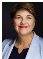
For Viola Amherd, the fundamental issue is whether Switzerland still wants an air force at all.

Opposition to the aircraft purchases comes from outside parliament. The Group for a Switzerland