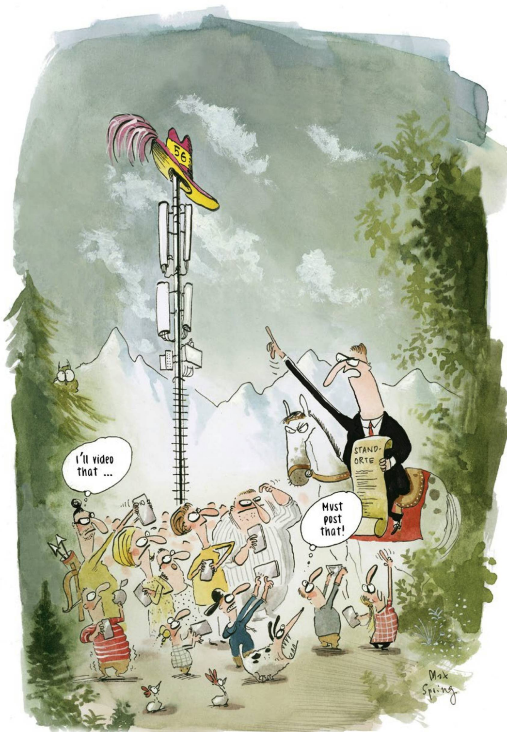
By Max Spring, the “Swiss Review” cartoonist

5G is also seen as key to boosting innovation in Switzerland. Those who champion 5G laud its ultra-high-speed and over-the-air data transmission capabilities that enable real-time connectivity between remote