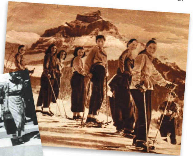
Memories of the 1942 camp – young Swiss Abroad trying their hand at winter sports in Engelberg