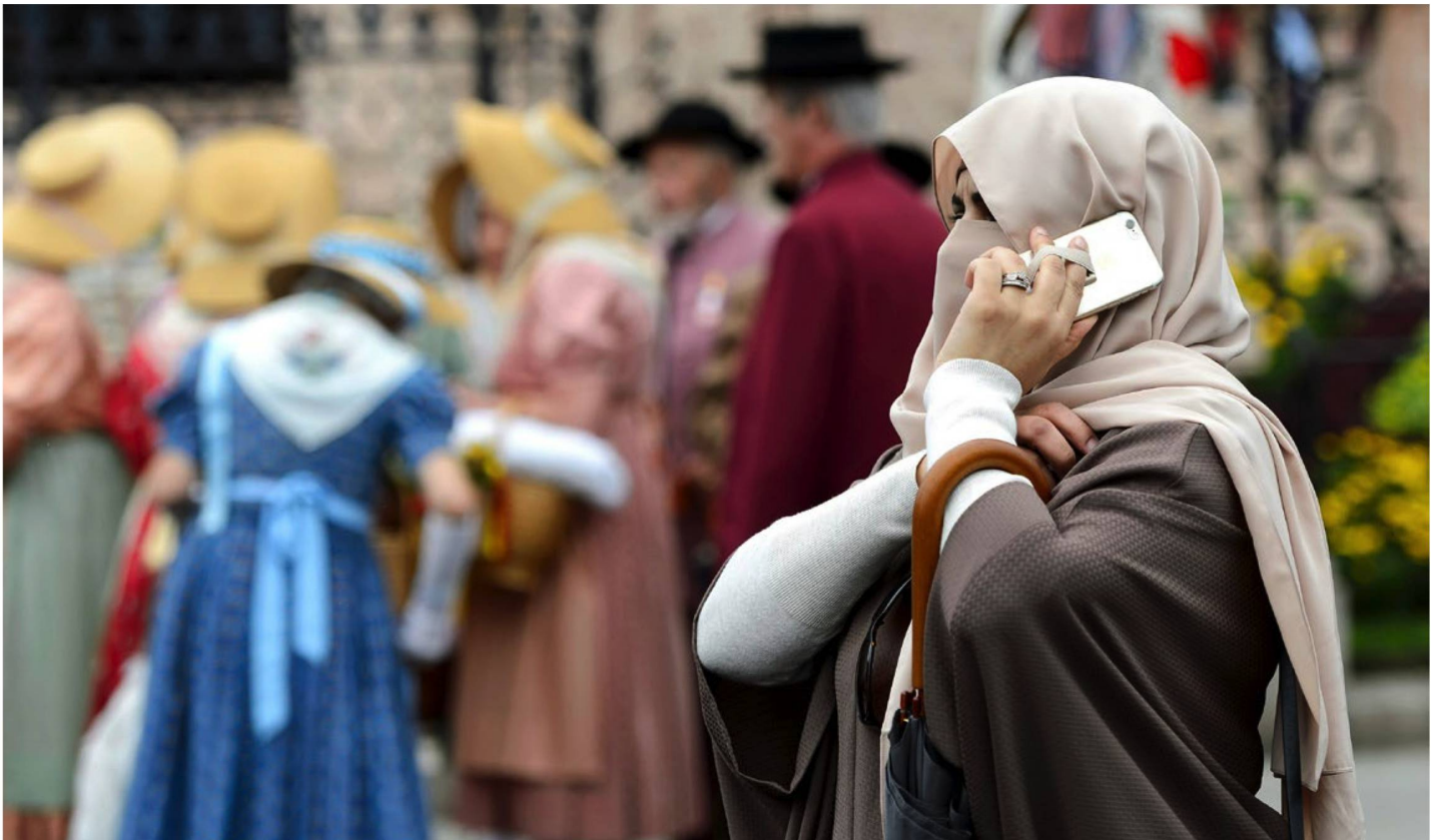
A veiled tourist and a local folklore group in Geneva – the Egerkingen Committee wants to ban cultural encounters like this one.