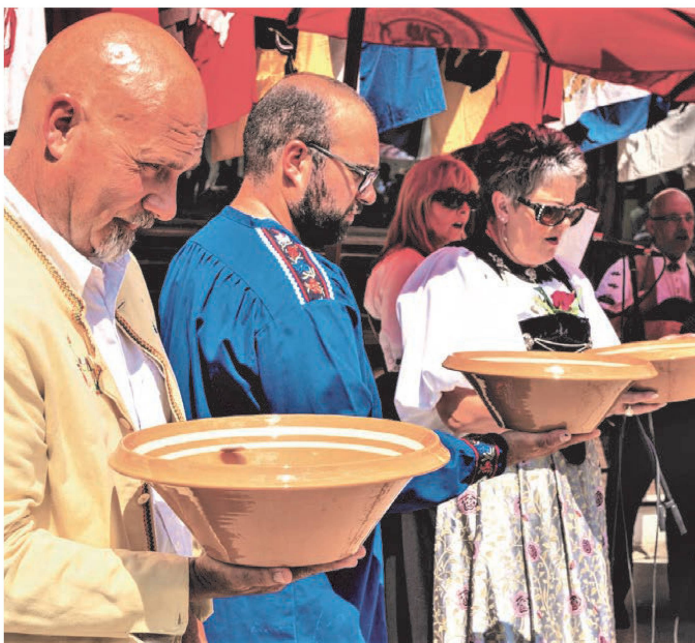
Talerschwinger / ronde de l'écu au Mont Sutton