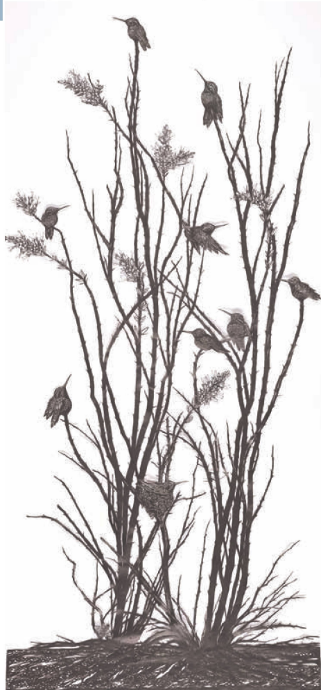
Ocotillo [2017; hand-cut black paper mounted on matt board, 60cm x 100cm, © Lucrezia Bieler]

“Transforming” is how Lucrezia Bieler describes her method: taking simple paper and turning it into strikingly complex and intricate designs using only a pair of scissors. She trained as a scientific illustrator but taught herself the art of paper cutting, which has a long history in Zurich, where she grew up and went to school. Now she lives