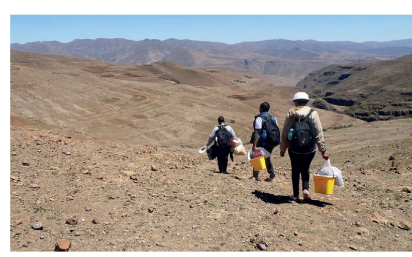
Community health workers guarantee access of testing and treatment.

Further collaborators include the University of Zurich (Department of Informatics) and an eHealth start-up from Lesotho.