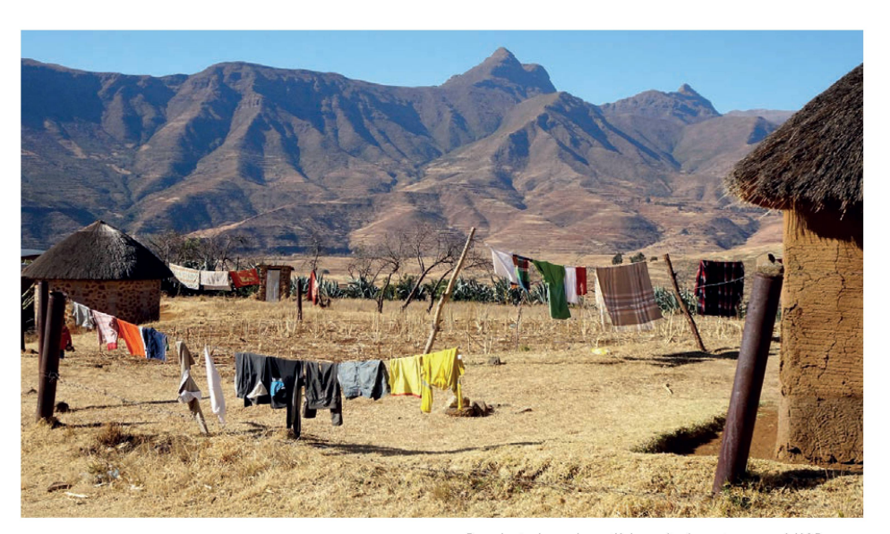
People in Lesotho will benefit from improved NCD care.