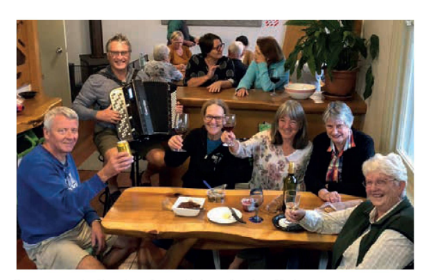
Fun time at the Hamilton Swiss Club weekend at Ohakune