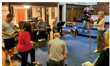
Yodel Choir & Folklore Group 'Baerg-Roeseli' hard at work