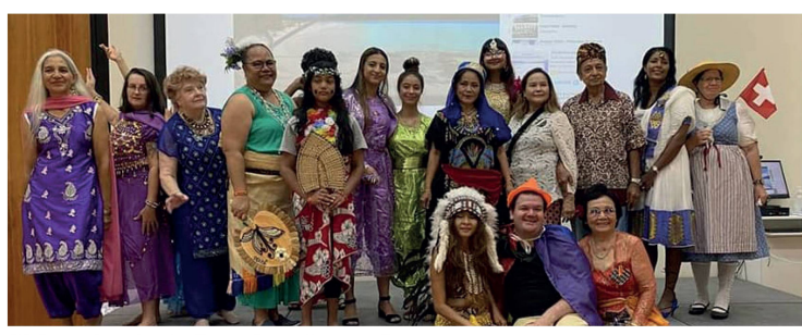
All dressed-up for the Fraser Coast Harmony Day