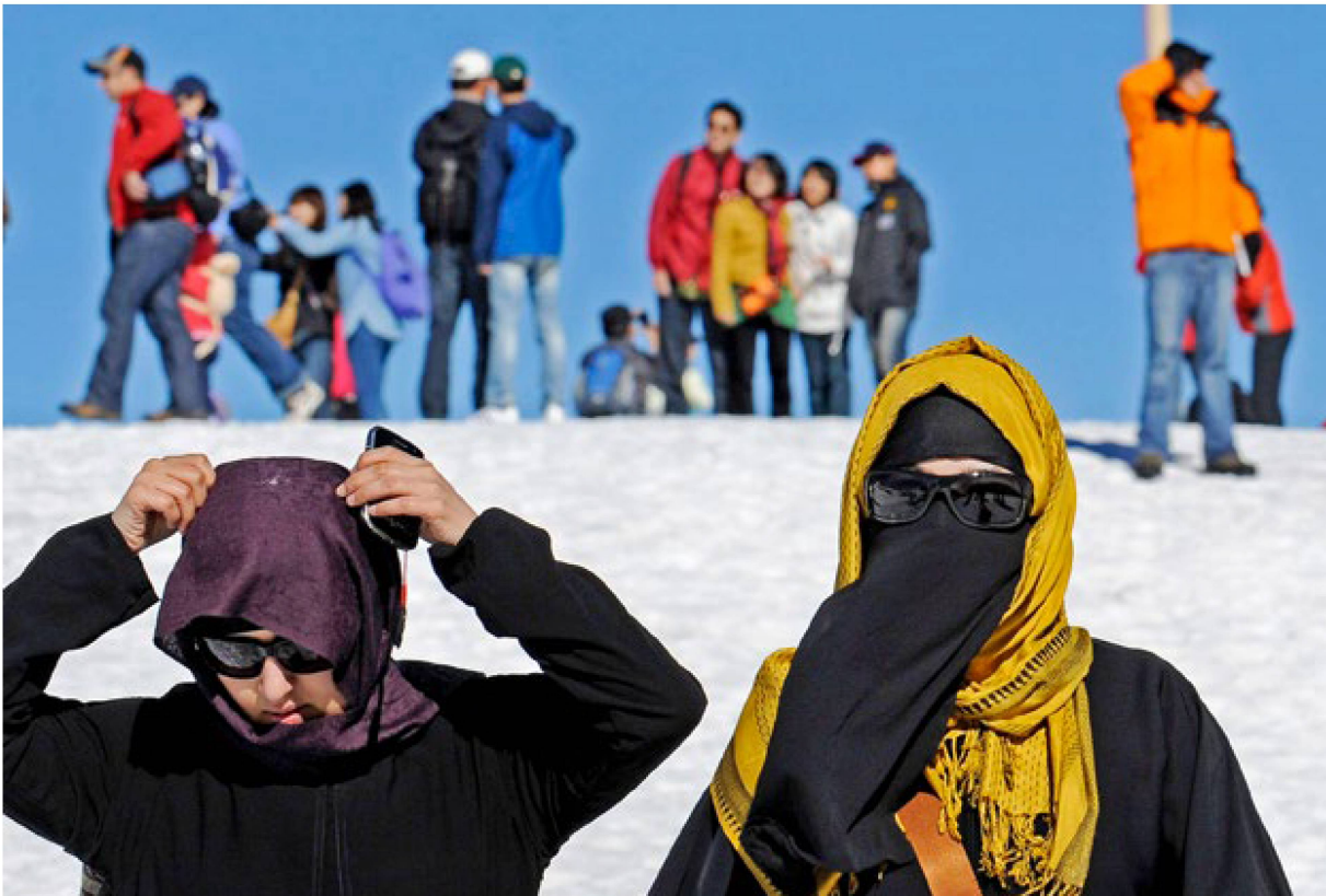
Tourists will not be allowed to wear full-face coverings in future – even to keep out the chill wind on the Jungfrauoch.