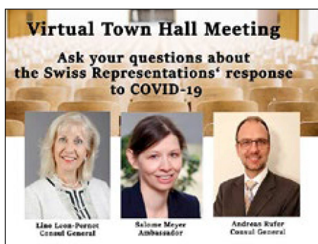
Simultaneously connected – Ottawa, Montreal and Vancouver all attended the town hall meeting

The Covid-19 pandemic has severely restricted our freedom of movement. But it has widened our horizons too. Given the global dimensions of the crisis, this means thinking outside the box to come up with good ideas that will enhance consular services. The “community meetings” hosted by the Swiss embassy in Thailand (see article on the left) were an inspiration for us in Canada to do something similar. However, we had to tailor our own virtual town hall