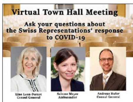
Simultaneously connected – Ottawa, Montreal and Vancouver all attended the town hall meeting

The Covid-19 pandemic has severely restricted our freedom of movement. But it has widened our horizons too. Given the global dimensions of the crisis, this means thinking outside the box to come up with good ideas that will enhance consular services. The “community meetings” hosted by the Swiss embassy in Thailand (see article on the left) were an inspiration for us in Canada to do something similar. However, we had to tailor our own virtual town hall