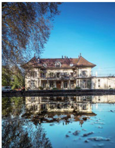
The Eichberg feudal country estate of the noble Bernese von Fischer family

As if preordained by Mother Nature some 14,000 years ago, there is something unique about Uetendorf's geographical whereabouts. When the Aare Glacier slowly receded at the end of the last Ice Age, it left behind a landscape of small hills that today look like natural viewing platforms offering a view over Uetendorf and across the levels of the Aare Valley to Thun. Look