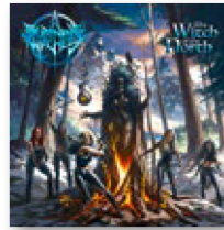
BURNING WITCHES: "The Witch Of The North" Nuclear Blast, 2021

They certainly haven't decided to reinvent the wheel. On the contrary, Burning Witches play a very traditional not to say old-fashioned type of heavy metal. Be that as it may, the Swiss combo have a certain something. On the one hand, they are an all-women band – still something of a novelty in their particular genre. Without doubt, this has turned heads. But they also market themselves very cleverly, portraying themselves as timeless fantasy heroines, maiden warriors, and witches – strong female characters whose powers are as striking as their looks.